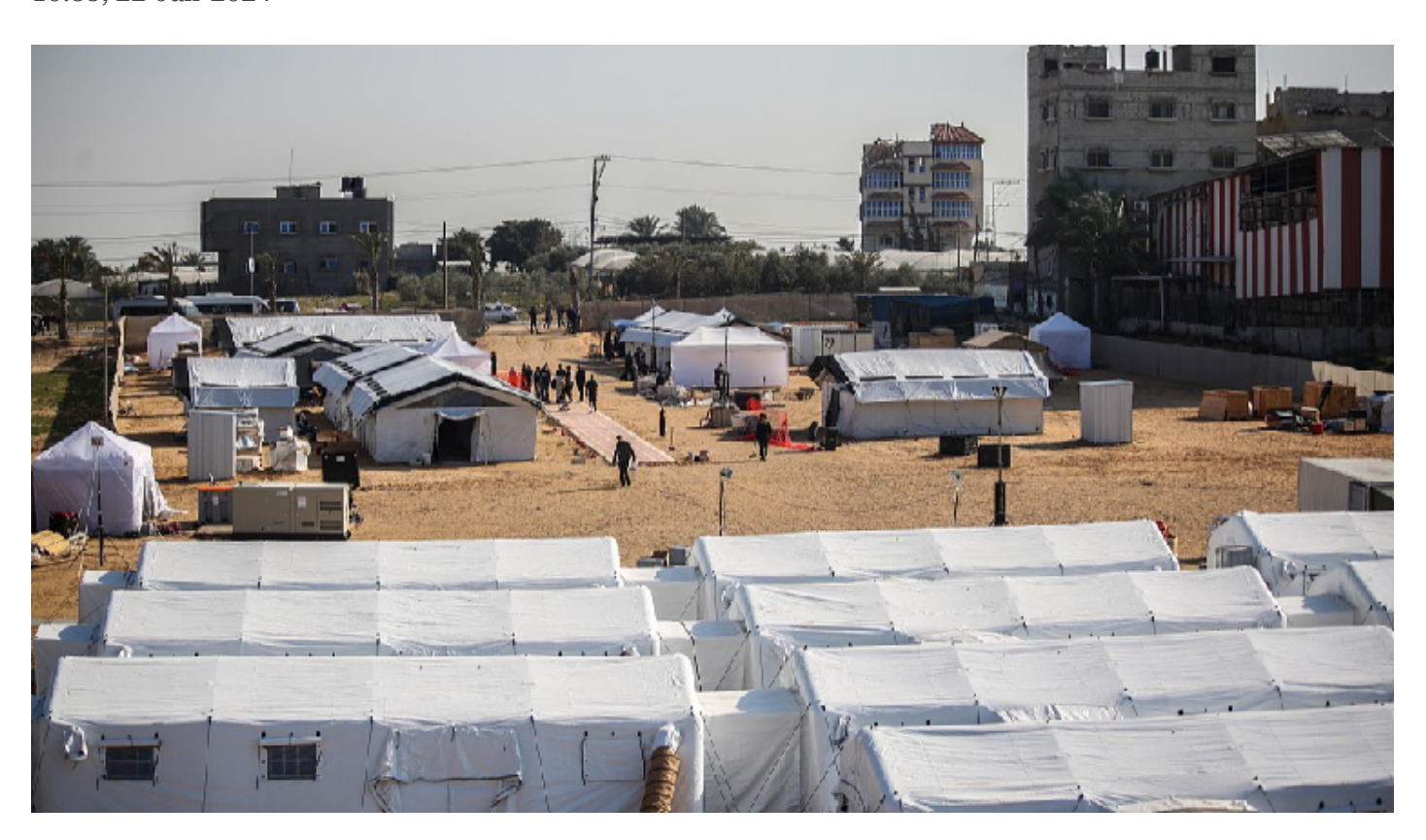
Gaza crisis: No peace plan yet, fighting rages on