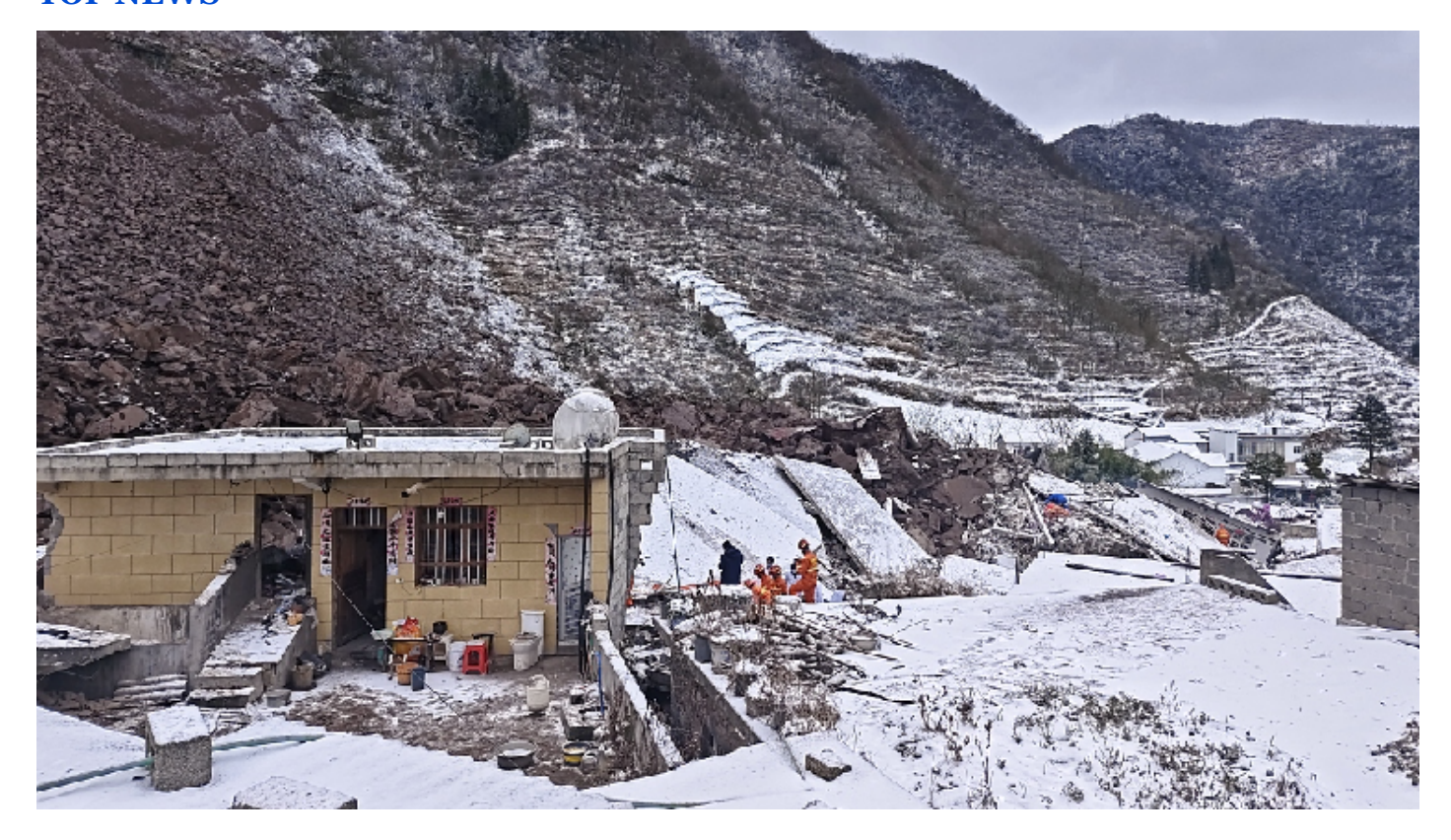
Xi orders all-out rescue of people missing in SW China landslide