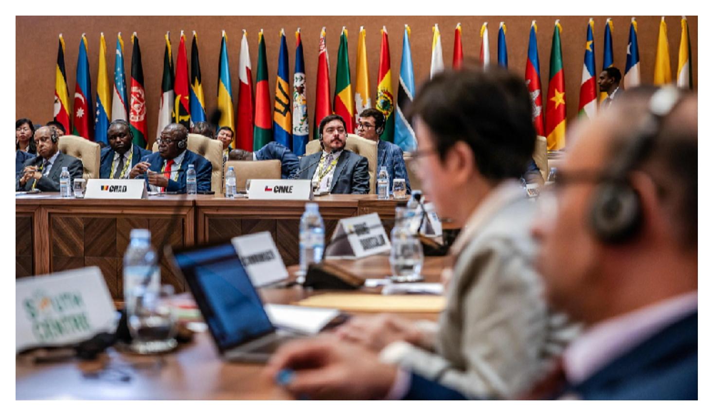
Non-Aligned Movement officials hail China's efforts in upholding global peace 10:33, 22-Jan-2024