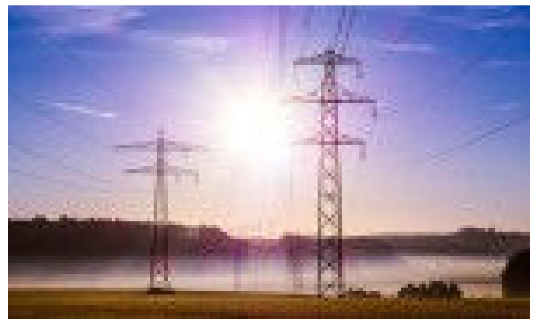
(http://www.dealstreetasia.com/stories/ifc-ema-power-invest-175-5m-in-summit-groupspower-projects-in-bangladesh-53052/) Bangladesh: IFC leads $175.5m investment in Summit Group's power projects (http://www.dealstreetasia.com/stories/ifc-ema-powerinvest-175-5m-in-summit-groups-power-projects-in-bangladesh-53052/)