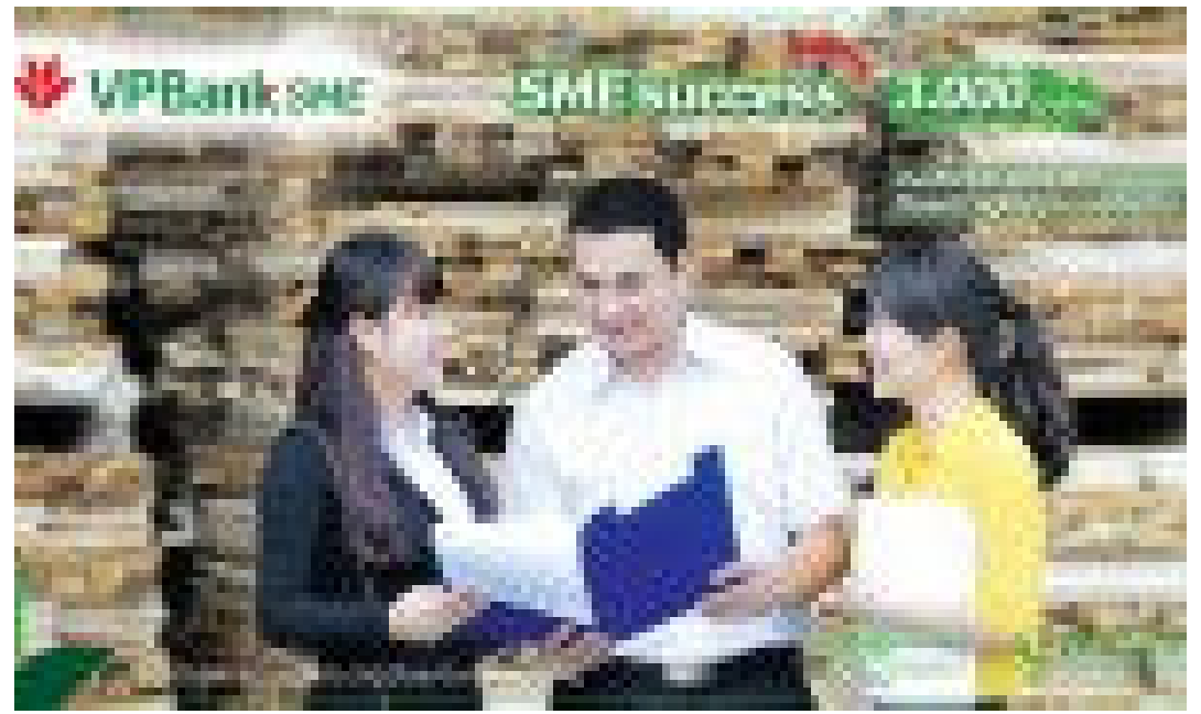
(http://www.dealstreetasia.com/stories/vietnam-ifc-provides-50m-loan-to-vpbank-to-help-small-women-led-cos-52941/) Vietnam: IFC provides $50m loan to VPBank to help SMEs, women-led cos (http://www.dealstreetasia.com/stories/vietnam-ifc-provides-50m-loan-to-vpbank-to-help-small-women-led-cos-52941/)