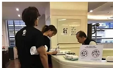
F4's Jerry Yan rumoured to be back with ex-girlfriend...

( http://www.asiaone.com/entertainment/katharine-mcphée-nixes-david-foster-romance-rumors )