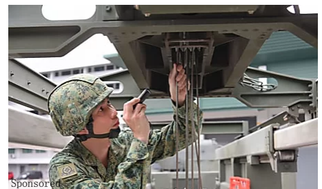
Step up to a job that challenges you like no other

( http://www.asiaone.com/entertainment/f4s-jerry-yan-rumoured-be-back-ex-girlfriend-lin-chiling )